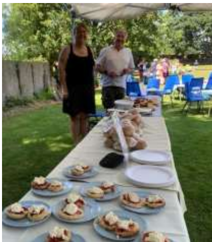
Delicious cakes, cream teas and sandwiches