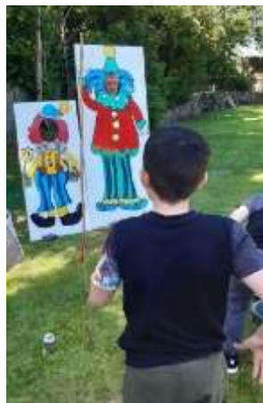
Great fun throwing wet sponges