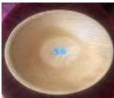
Here's How It Was Used!